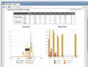
TrueView Web Report® helps you store and analyze traffic data over time.