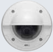
P3364-VE (6 mm lens) equipped with TrueView Bicycle offers an unmatched standalone pedestrian and bicycle counting solution, not requiring any additional hardware.